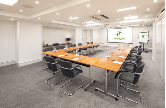
Henry VIII Suite Langley Suite